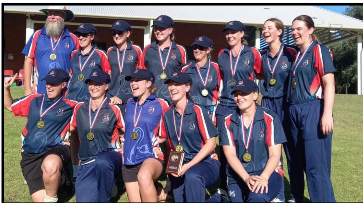
2023 Premiers A Grade: Bunbury Red